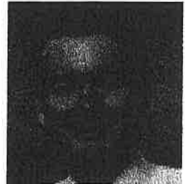
US Senator Michael Bennet

Speakers from the Colorado Department of Labor and Employment, Lt. Governor's Office, and SLV Area Health Education Center reported on their roles and continuing offers of resources and support. Community health workers shared information about their efforts to assist families with needs such as masks, hand sanitizer, food, rental assistance, referrals and moral support.